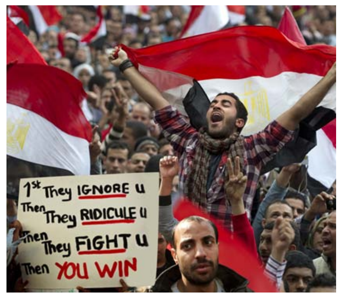
Tahrir Square, Cairo, Egypt