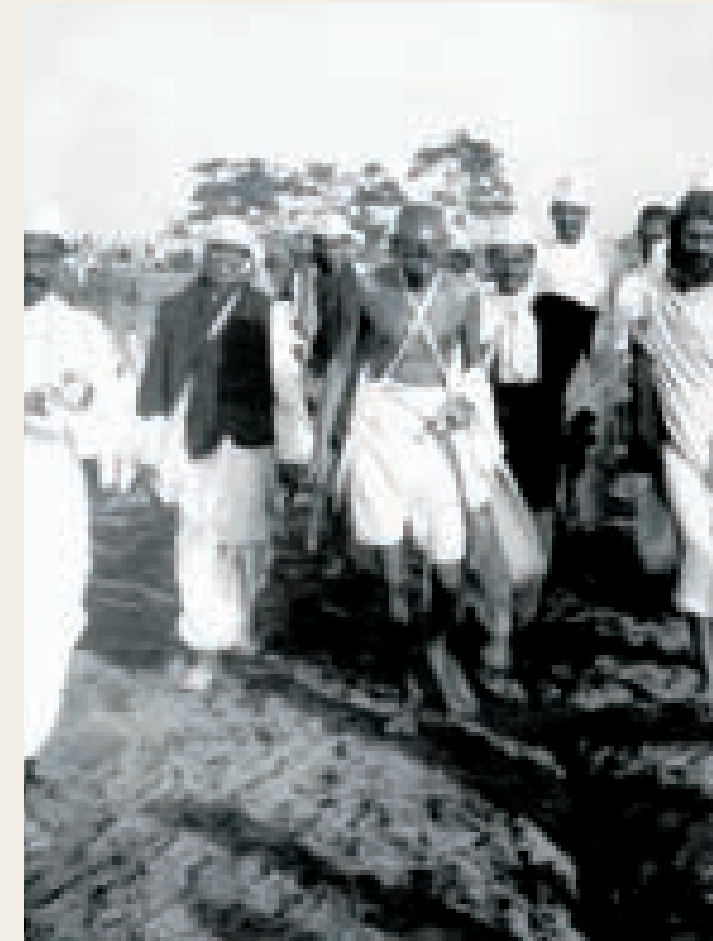
My first art acquisition ever was inspired by the Salt Satyagraha, the determination of the great soul captured in this sketch was magnetic. Time places MKG's Salt Satyagraha, 1930 between Boston Tea Party, 1773 and Civil Rights March on Washington, 1963 by Martin Luther King Jr., among the Top 10 Most Influential Protests in the world.