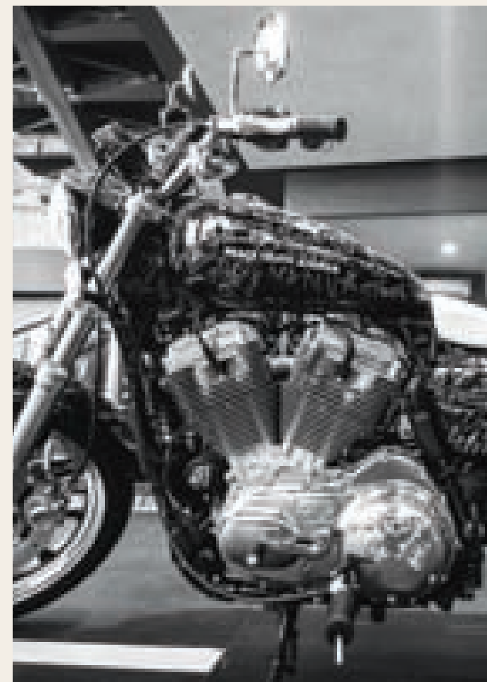
The energy in the hall that night was inspiring; the excitement of the future ambassadors of Peace, Truth and Ahimsa was humbling... If you are wondering why a Harley Davidson, request you to check out a short clip on YouTube from the event.

Called to the Bar and enrolled in the High Court the next day-10th June 1891